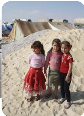
Palestinian refugee children at al Tanf camp in the Iraq-Syria border region, November 2008.