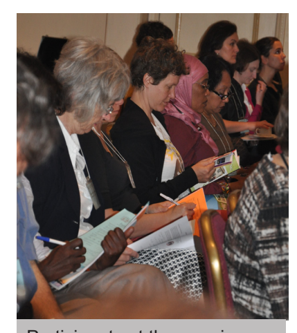
Participants at the opening plenary session of the CCR Consultation in Fredericton, May 2012.