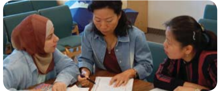
Students learning English at the Mennonite New Life Centre of Toronto (a CCR member organization).

One of the biggest barriers to integration is lack of permanent status in Canada. There are thousands of people living in limbo, unable to get on with their lives, denied many rights and services. Many of those affected are children. People living in limbo include nationals of moratoria countries: countries to which Canada has halted deportations, due to the generalized insecurity there. Most such nationals will likely end up receiving permanent residence, but meanwhile, their lives are on hold, in some cases for more than 10 years – an unspeakable waste not only for them and their families, but also for Canada.