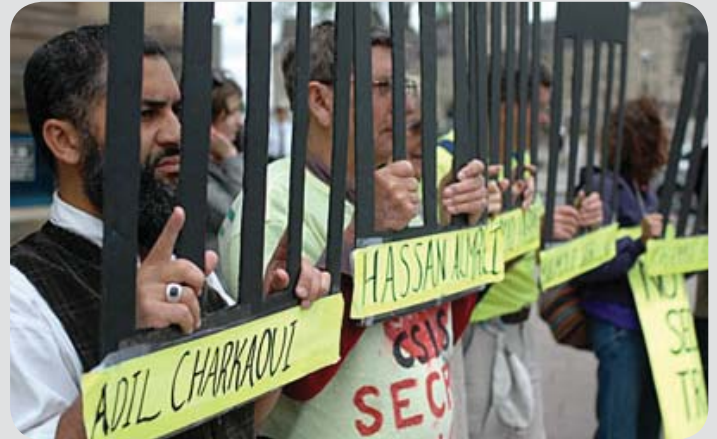
Opponents of security certificates at the Supreme Court hearings in Ottawa.