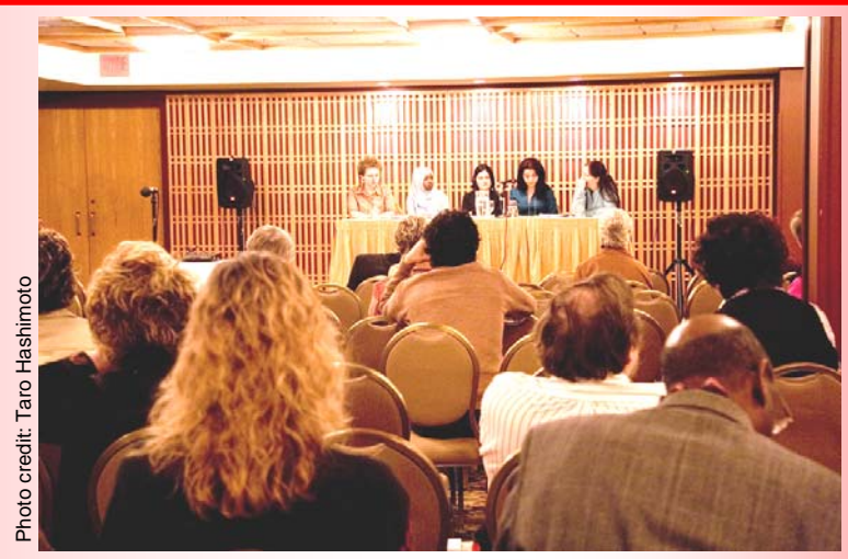
Panel participants at a workshop session during 'Taking the Lead: Refugee and Immigrant Youth', the CCR Fall Consultation in November 2006.

The CCR's work in this area receives significant support from the Maytree Foundation.