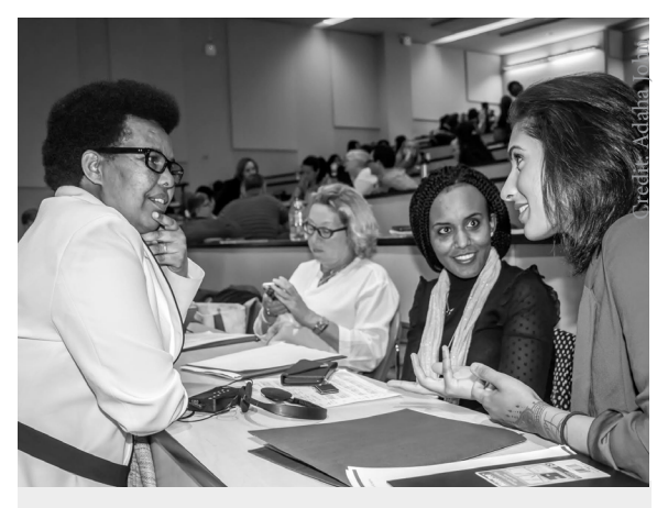
Participants at the International Refugee Rights Conference, Toronto, June 2018.